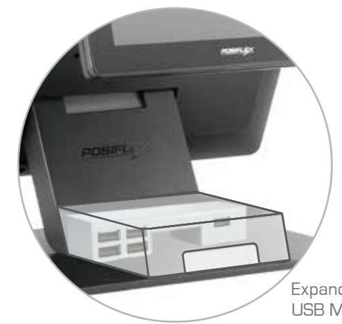
Expandable USB Module

A unique cabling system (I/O expansion are centralized and hidden in the rear cover) delivers a truly clutter-free station. The standard base can house the optional PoweredUSB or USB extension module, while retaining the sleek look.